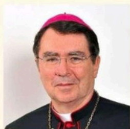
Cardenal Christophe Pierre